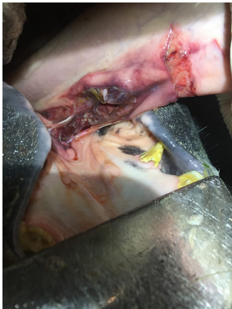
Torn frenulum (underside)