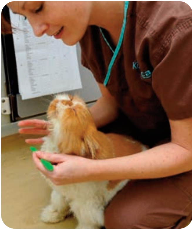
Figure 5: Nursing care and a quiet and calm environment with gentle handling are important aspects of pain management in a veterinary clinic.

groomed and fed. They may also be involved in providing non-medical pain control such as using cold packs on sore areas.