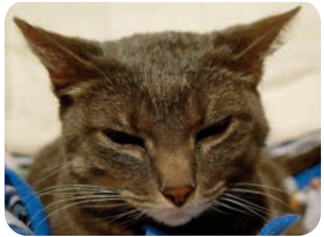
Figure 1: This cat is experiencing abdominal pain associated with severe constipation. Veterinary professionals look at ear position (in this case, ears drawn backwards with increased distance between the ear tips), eyes (partially closed), muzzle tension, whiskers (straight) and head position to indicate pain using the Feline Grimace Scale ( felinegrimacescale.com ). This pain assessment tool can also be used by owners/caregivers at home.

Most cats will undergo at least one surgical procedure in their lifetime, most commonly neutering and dental procedures, and any surgery is likely to be associated with some pain. Additionally, illnesses such as pancreatitis, infections, abscesses and cancers, plus traumatic injuries such as broken bones or bruising from a car accident, or bites and scratches inflicted during a cat fight, will cause acute pain. It is reasonable to assume that anything that would cause us pain, will also cause pain in cats and be just as distressing for them.