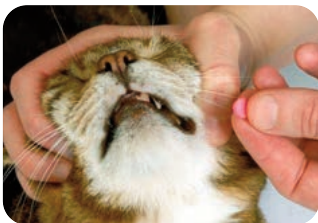
Figure 6: Giving medications to cats, including pain medications, can be challenging, but is vital to prevent pain developing after an illness or surgery. Contact your veterinary clinic if you are struggling to medicate your cat and do not stop pain medications, even if the cat seems comfortable, unless directed by your veterinarian.

Cats in pain and/or recovering from illness or surgery may be prescribed ongoing pain medications to be given at home. Medicating cats is not always easy, so be sure you are clear on the precise amount to administer (eg, by asking for a demonstration on drawing up liquids into a syringe), how long to give the medication for, how frequently, and if the medication can be given in food or a treat; if medication is put directly into the cat's mouth, ask the veterinarian or veterinary nurse/technician to show you how (Figure 6) (see icatcare.org/advice/how-to-give-your-cat-a-tablet/ ). Always contact your veterinary clinic if you are struggling to give prescribed medications. They will understand the challenges and can often help by providing alternative medications, for example. If your cat seems comfortable, do not stop the pain medication unless told to do so by your veterinarian, as this may allow pain to develop and ultimately become harder to control.