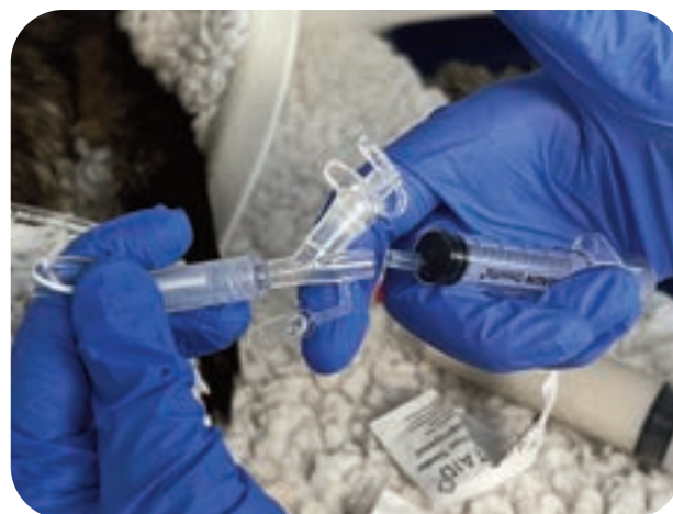
Figure 5a: The tube is pinched closed to avoid leakage before attaching syringes for checking placement or for feeding.