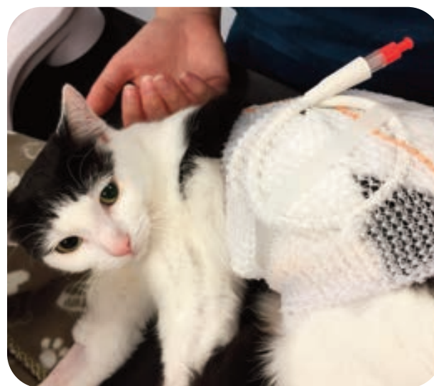
Figure 3: A gastrostomy tube enters the cat's stomach from the outside and is used for longer term feeding.

(which run from the outside of the neck into the oesophagus; Figure 2). Feeding tubes are sometimes placed through the abdominal wall into the stomach (gastrostomy or PEG tubes, Figure 3).