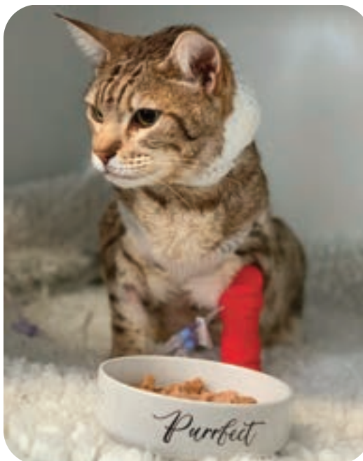
Figure 4: This patient with an oesophagostomy tube is being offered food to 'test' the appetite.

Cats with feeding tubes will, in most cases, have a length of tube coiled around and tucked into a dressing, or a short length of tube protruding from the skin. Consequently, they cannot be allowed full, unsupervised outdoor access, as they may knock and dislodge the tube. Contained outdoor access in pens or enclosures may be acceptable, but should first be discussed with your veterinary clinic.