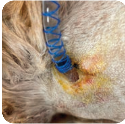
Figure 7b: This feeding tube site has a little exudate (pus) and mild redness. The area should be cleaned with disinfectant as advised by the veterinary clinic and monitored for any change. If concerned, it is a good idea to take a clear photograph to show your veterinary team.