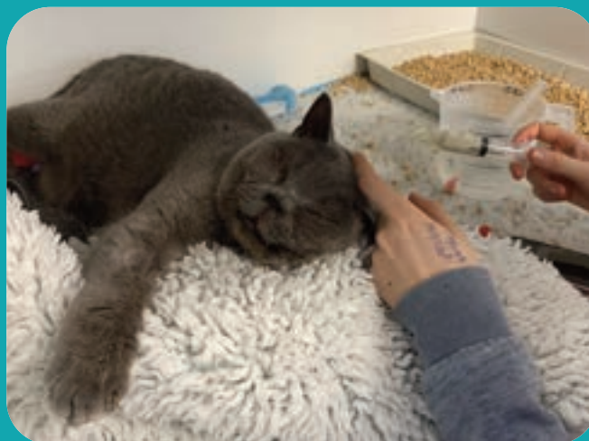
Figure 8: This cat is being fed via an oesophagostomy tube. In the background is a jug of warm water with the syringes of food. The cat has a blanket under his head to raise it slightly. He is enjoying a stroke during feeding, as is his individual preference.