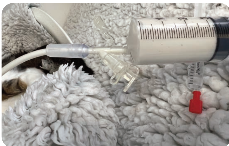
Figure 6: Food should pass slowly into the tube to avoid causing discomfort.