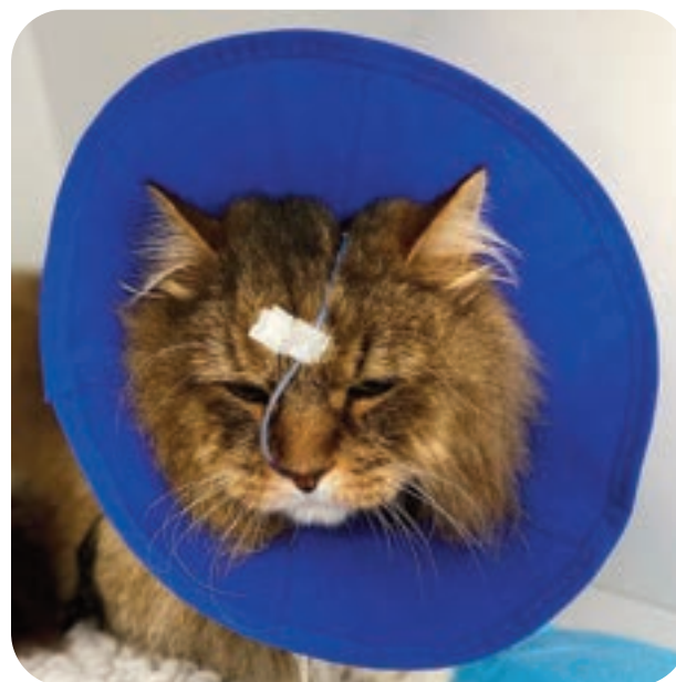
Figure 1: Naso-oesophageal or nasogastric tubes are used to provide food and water while a cat is in hospital.

(which run from the outside of the neck into the oesophagus; Figure 2). Feeding tubes are sometimes placed through the abdominal wall into the stomach (gastrostomy or PEG tubes, Figure 3).