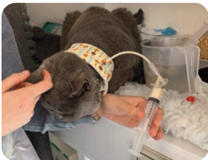
Figure 2: This cat has an oesophagostomy feeding tube, which is tucked into a cloth collar around the neck.

The most common types of feeding tube are naso-oesophageal/nasogastric tubes (inserted through the nose into the oesophagus or stomach, respectively; Figure 1) and oesophagostomy tubes (called 'O' tubes)