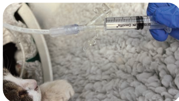
Figure 5c: Flush the tube well with clean water before and after feeding, to avoid obstructions.