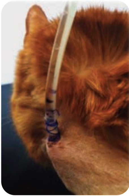
Figure 7a: A clean and dry oesophagostomy tube site.