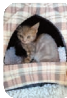
Figure 3: A hospital cage can be designed and furnished to make cats feel comfortable. This kitten has a soft bed in which to hide and feel safe.