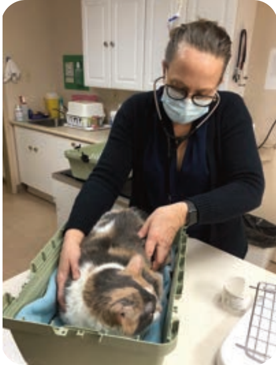
Figure 5: Examining a cat in the bottom of their carrier after removing the top means they can feel safe and secure. They can also be allowed to hide under a blanket if they choose.

Staff in Cat Friendly Clinics should always handle cats gently and kindly, watching their behaviour and considering what emotions the cat may be feeling. Cats should never be held down to keep them still for procedures or grasped or lifted by the 'scruff' (skin on the back of the neck; Figure 4), as this will cause fear and pain, and lead to the cat developing negative associations with the clinic. Veterinary professionals at Cat Friendly Clinics have learnt to change the way they touch and hold their patients, to ensure the cat is comfortable (Figures 5 and 6).