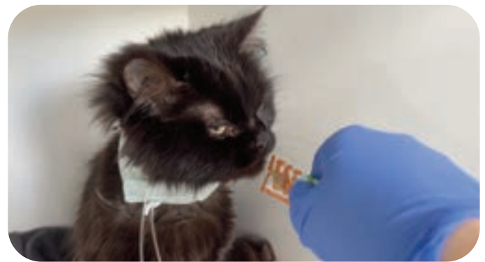
Figure 6: Cats like treats too! Liquid or other types of treats can be offered while the cat is examined, to make the experience more positive.

Veterinary professionals in Cat Friendly Clinics are well trained and stay up to date with the latest information on the veterinary care of cats through their membership of ISFM or AAFP. They enjoy learning more about how to care for cats in their clinic, and attend lectures and conferences, sharing that knowledge with the rest of the veterinary team.