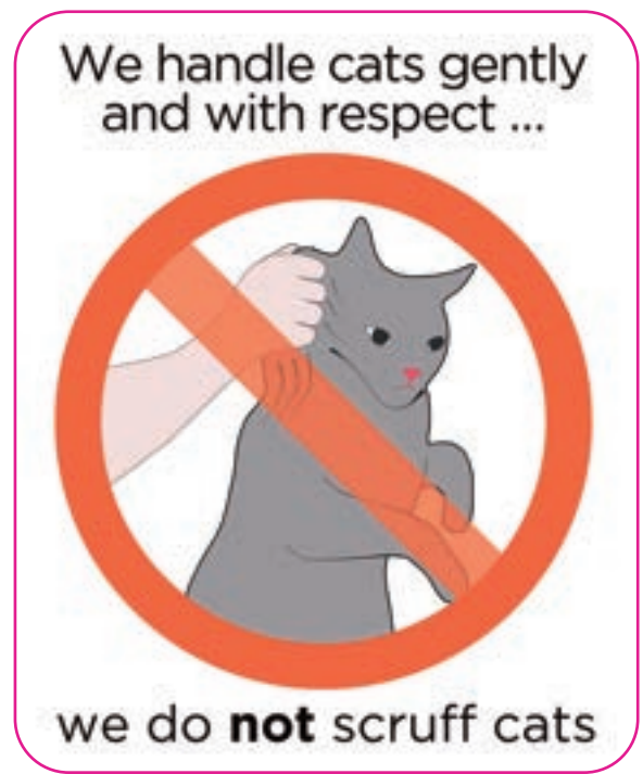
Figure 4: In Cat Friendly Clinics, cats are handled gently and calmly.